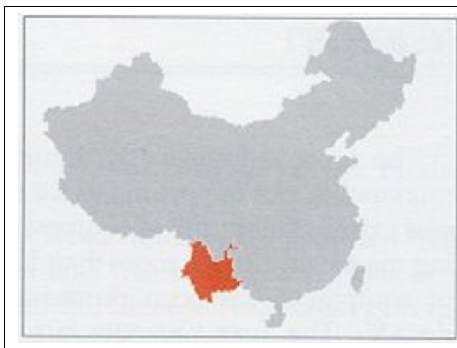
China with Yunnan Province highlighted in red.